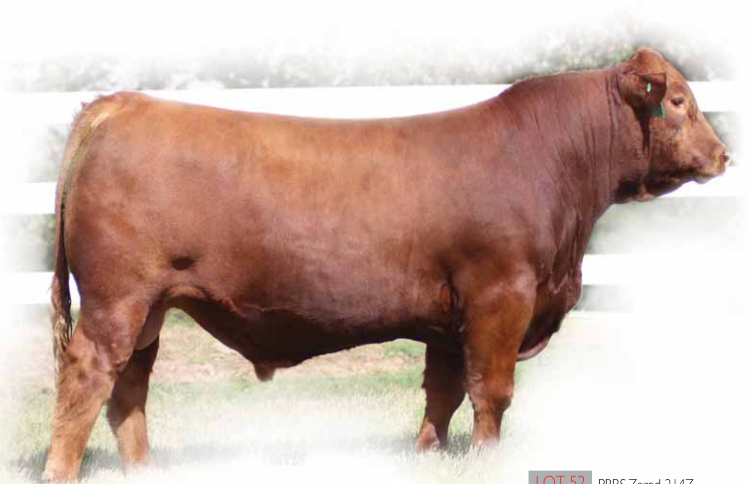
LOT 52 PBRS Zared 214Z