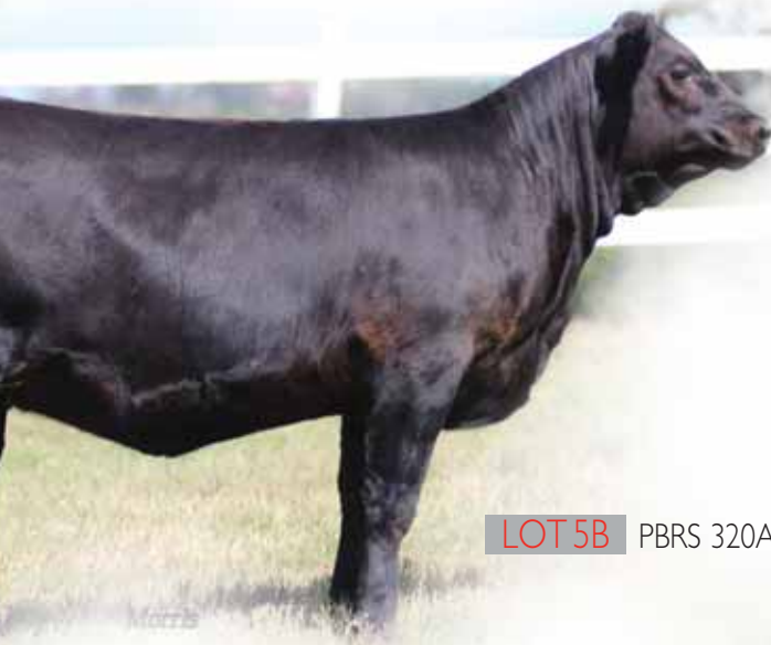
LOT 5B PBRs 320A