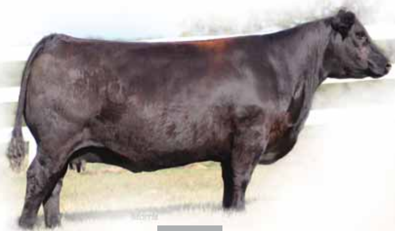
LOT 47 JJE Tierra 713T