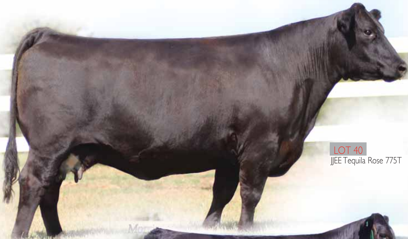
LOT 40 JJE Tequila Rose 775T