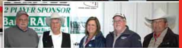
The little Ranch with BIG genetics.