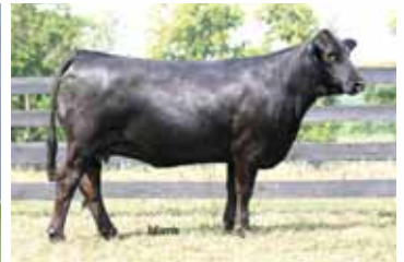
PBRS Touch Me Gently 798T Top donor for Diamond Hill, Coyote Hills Ranch & Hall Cattle Co.