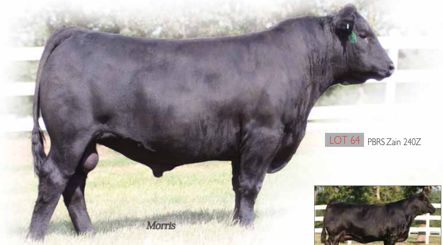
LOT 64 PBRS Zain 240Z