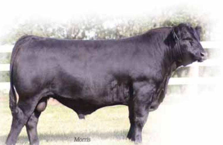
LOT 77 PBRS 228Z