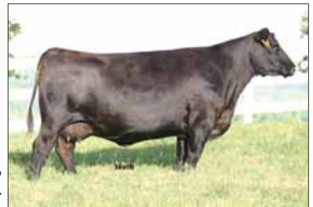
MAGS Nadine 110N, dam of Lot 23.