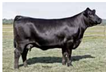
MCBN Tranquility Brown 708T $30,000 valued top-selling lot from the 2008 Denver National Sale going from Brown to Tubmill Creek Farms.