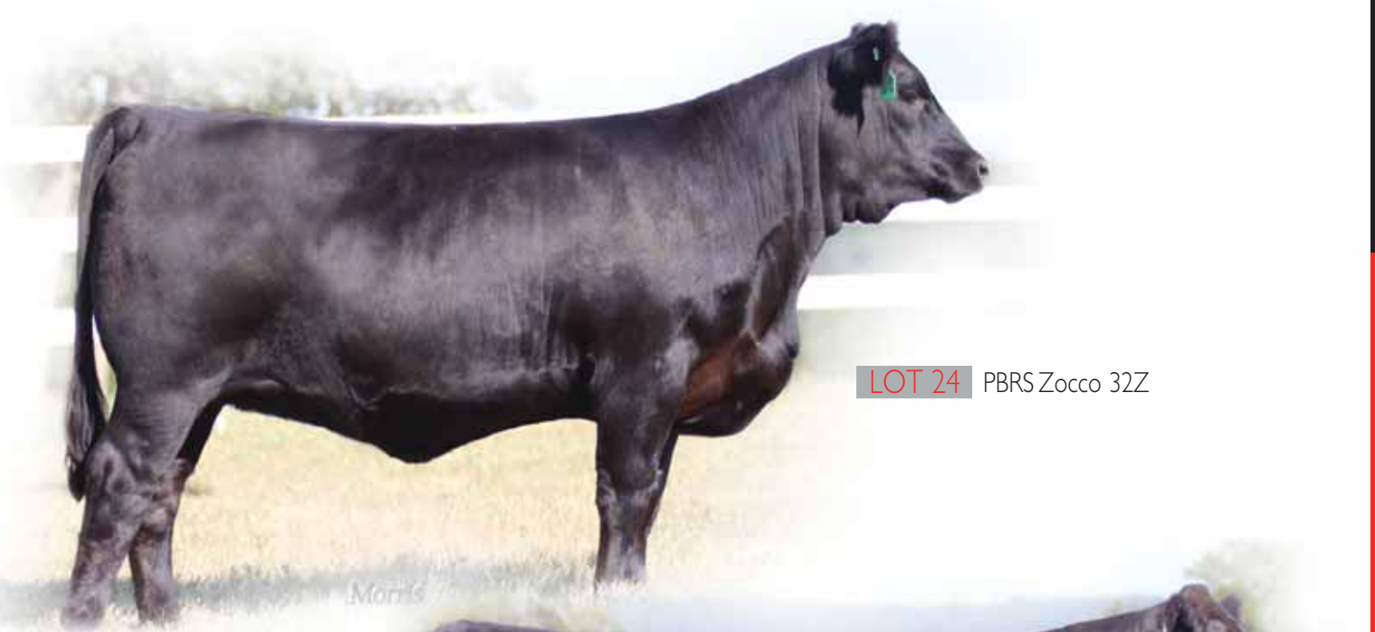
LOT 24 PBRs Zocco 32Z