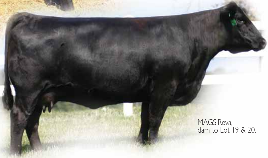
MAGS Reva, dam to Lot 19 & 20.