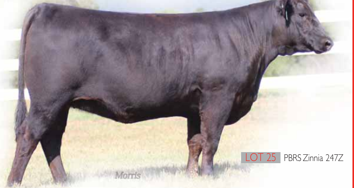
LOT 25 PBRs Zinnia 247Z