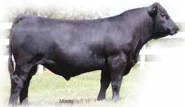
LOT 75 PBRS Zoom In 232Z