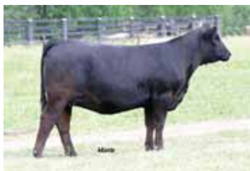
SBLX Xina Colada 364X $21,000 valued female from the 2012 Godfrey sale purchased by Edwards Land & Cattle Co.