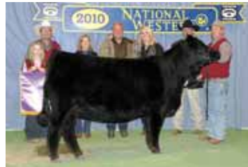
MAGS Uahuka 3602U 2010 National Champion Female for Magness & Bella Star Limousin.