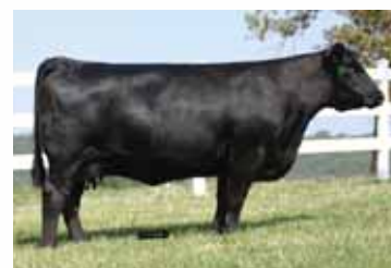
MAGS Reva, dam of Lot 61 - 63.