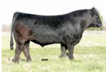
BOHI Titlelist 705T Senior herd sire at Massey Limousin.