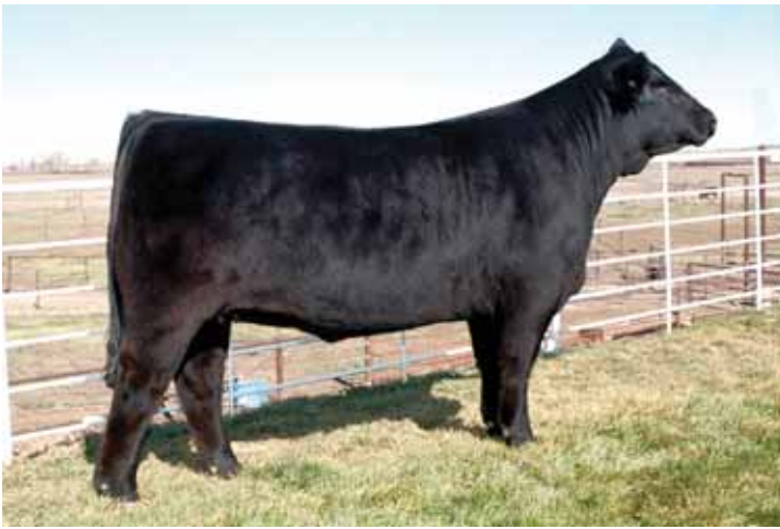
MAGS Natasha, dam of Lot 26.