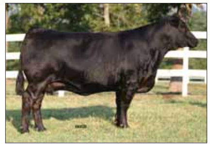
WLR Rendezvous 050R, dam of Lot 64 - 66.