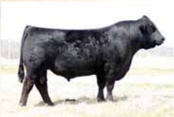
BOHI Top Dollar Highly syndicated lot owned by Magness, Jepson & Edwards Land & Cattle Co.