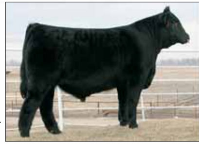
MAGS Unloosen, sire to Lot 28 & 29.