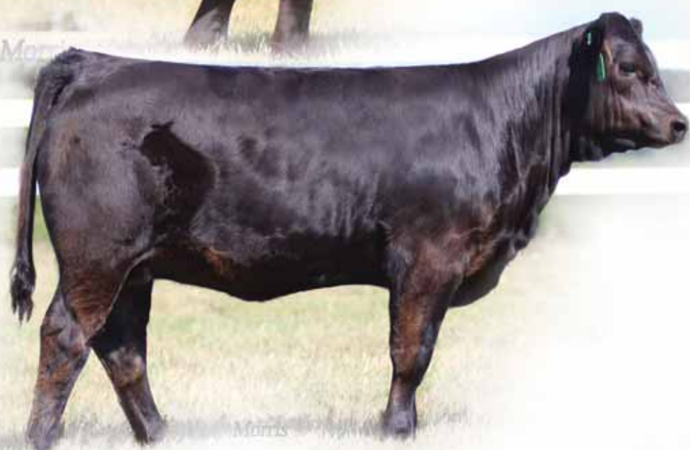
LOT 40a PBRS Absolutely 332A