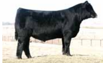
MAGS Xukalani 3624U Leadin AI sire working at Linhart Limousin, Magness & Salt Creek Cattle Co.