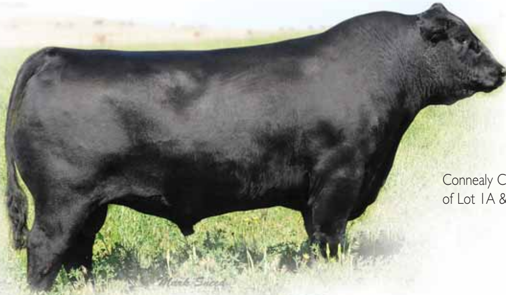
Connealy Consensus, sire of Lot 1A & 1B