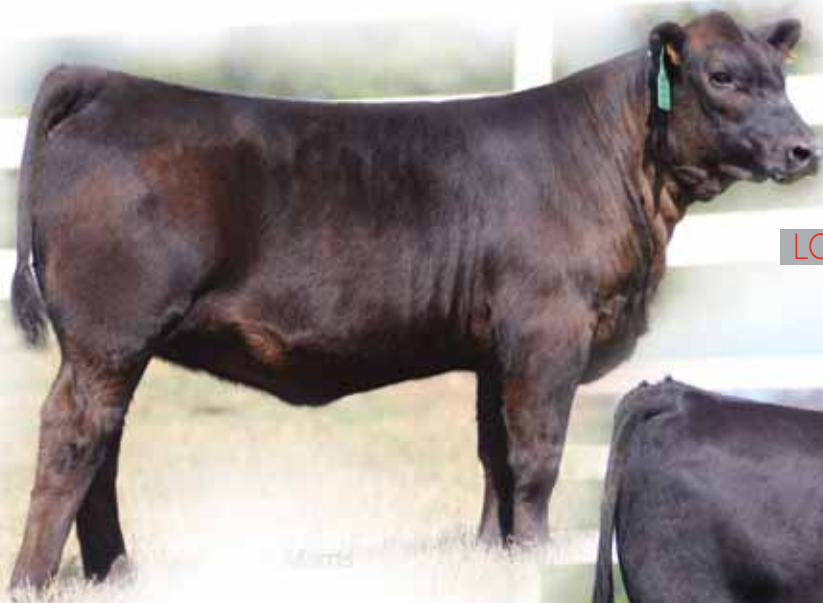
LOT 5A PBRs 3125A