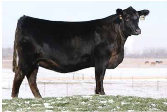
MAGS Universal Time, dam of Lot 72.