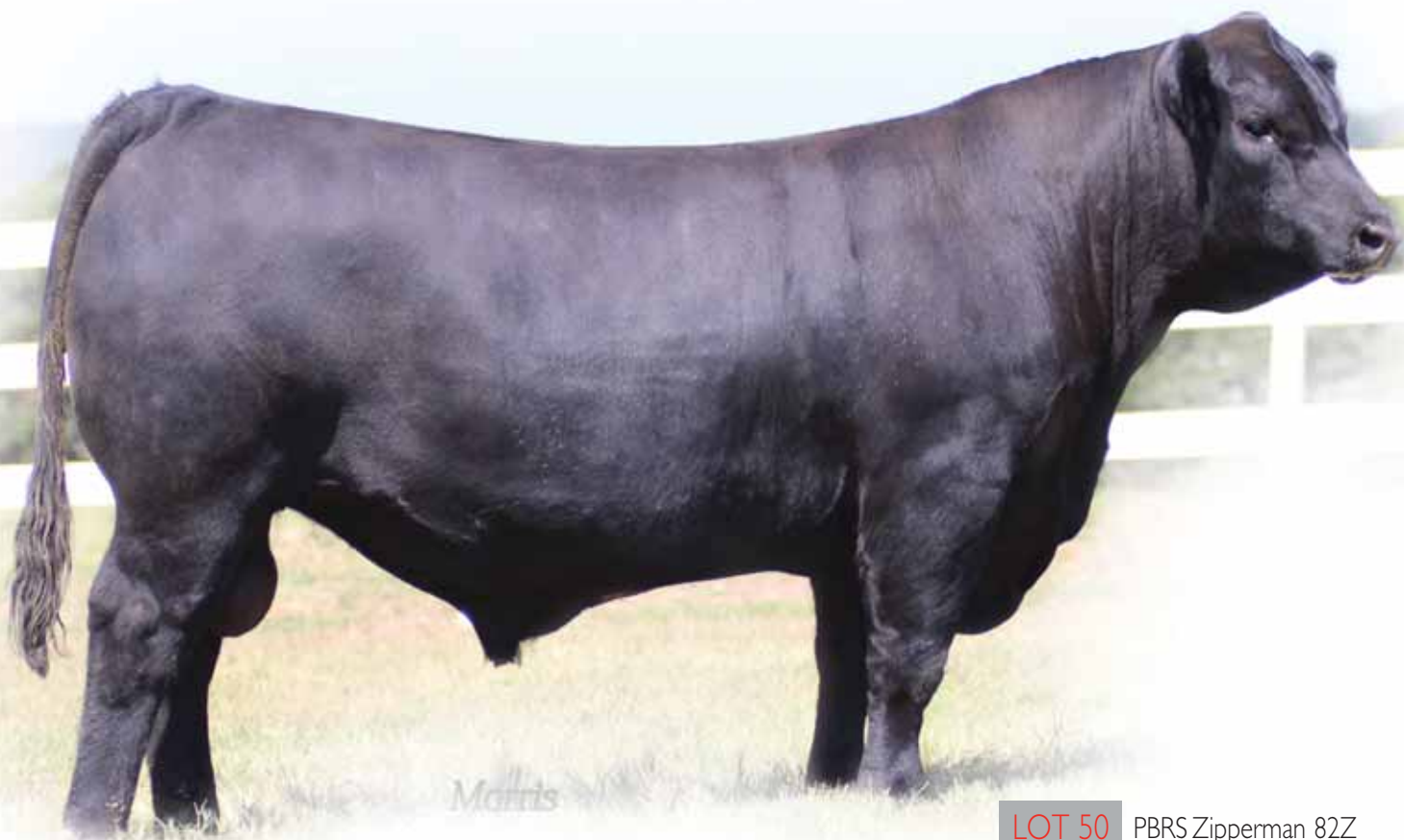
LOT 50 PBRs Zipperman 82Z