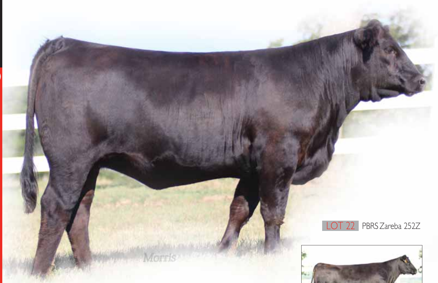
LOT 22 PBRZ Zareba 252Z