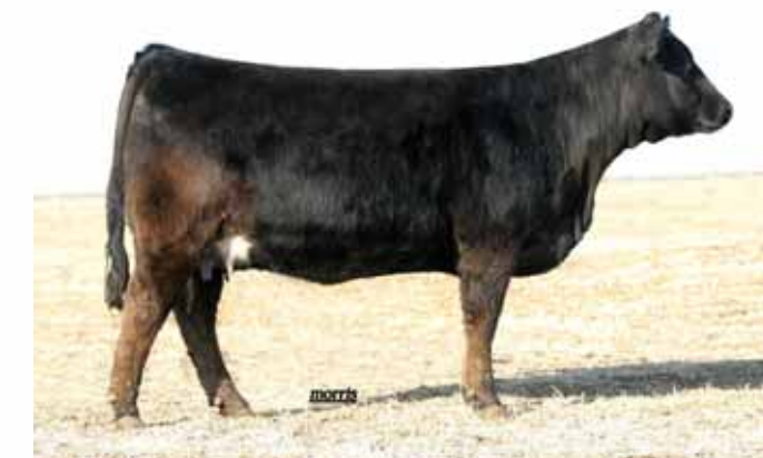
WLR Sheba 265S, dam of Lot 32.