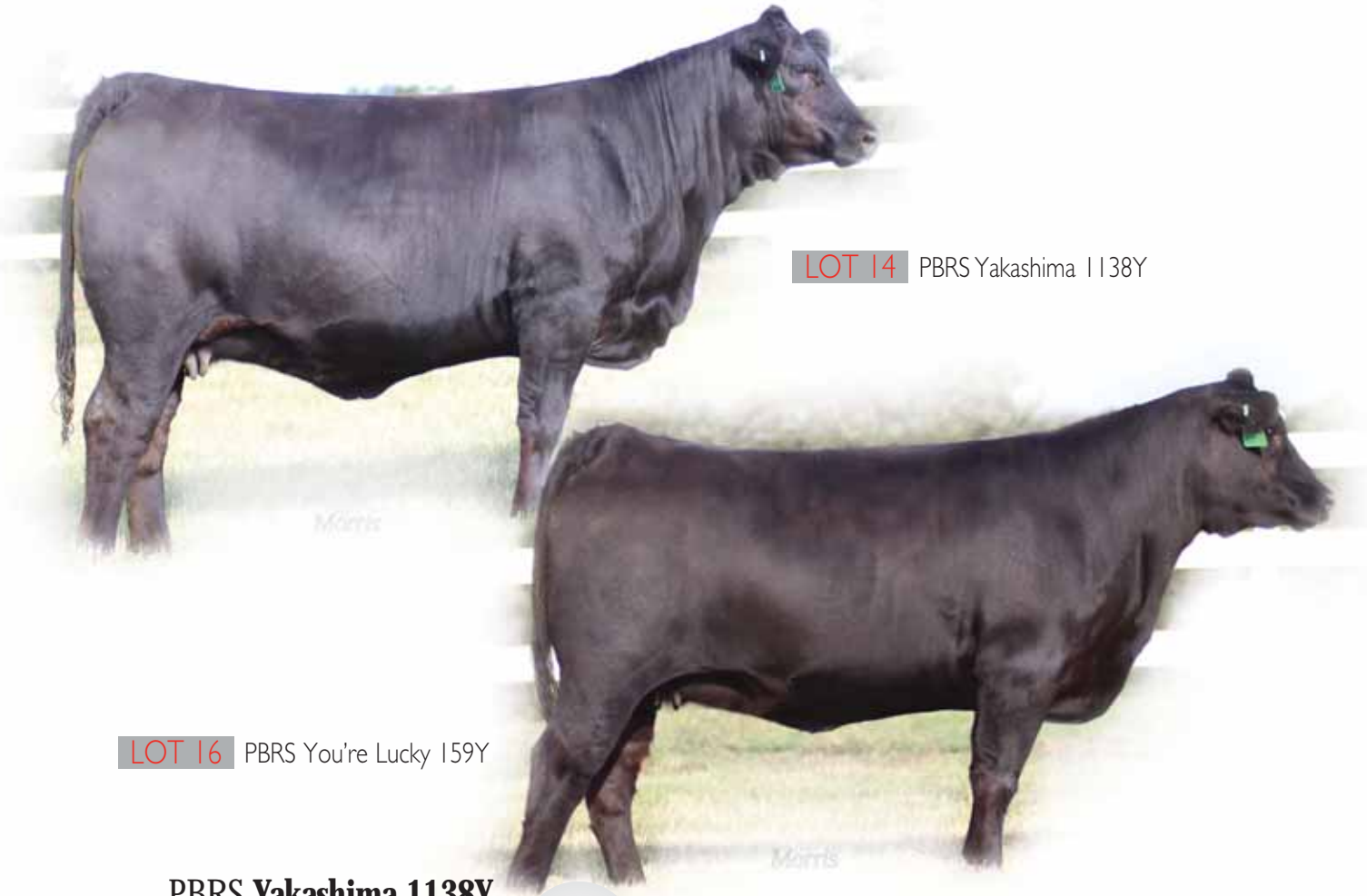
LOT 14 PBRS Yakashima 1138Y