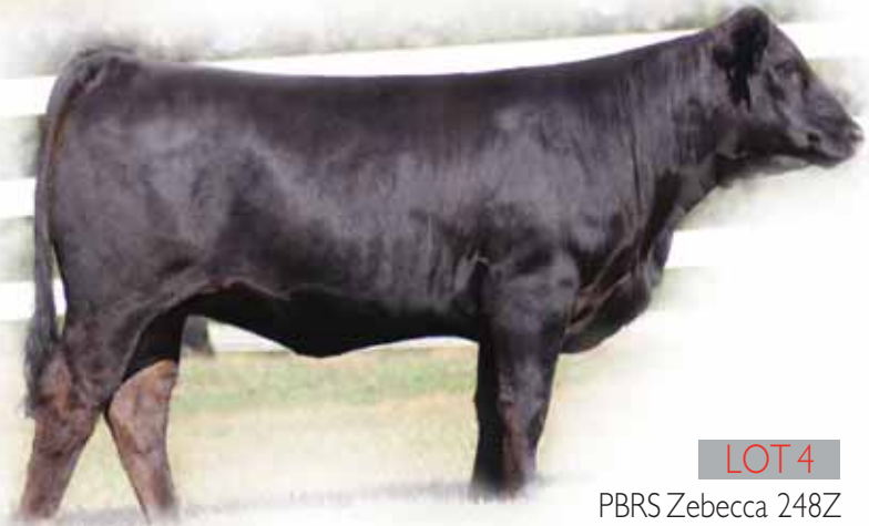
LOT 4 PBRs Zebeca 248Z