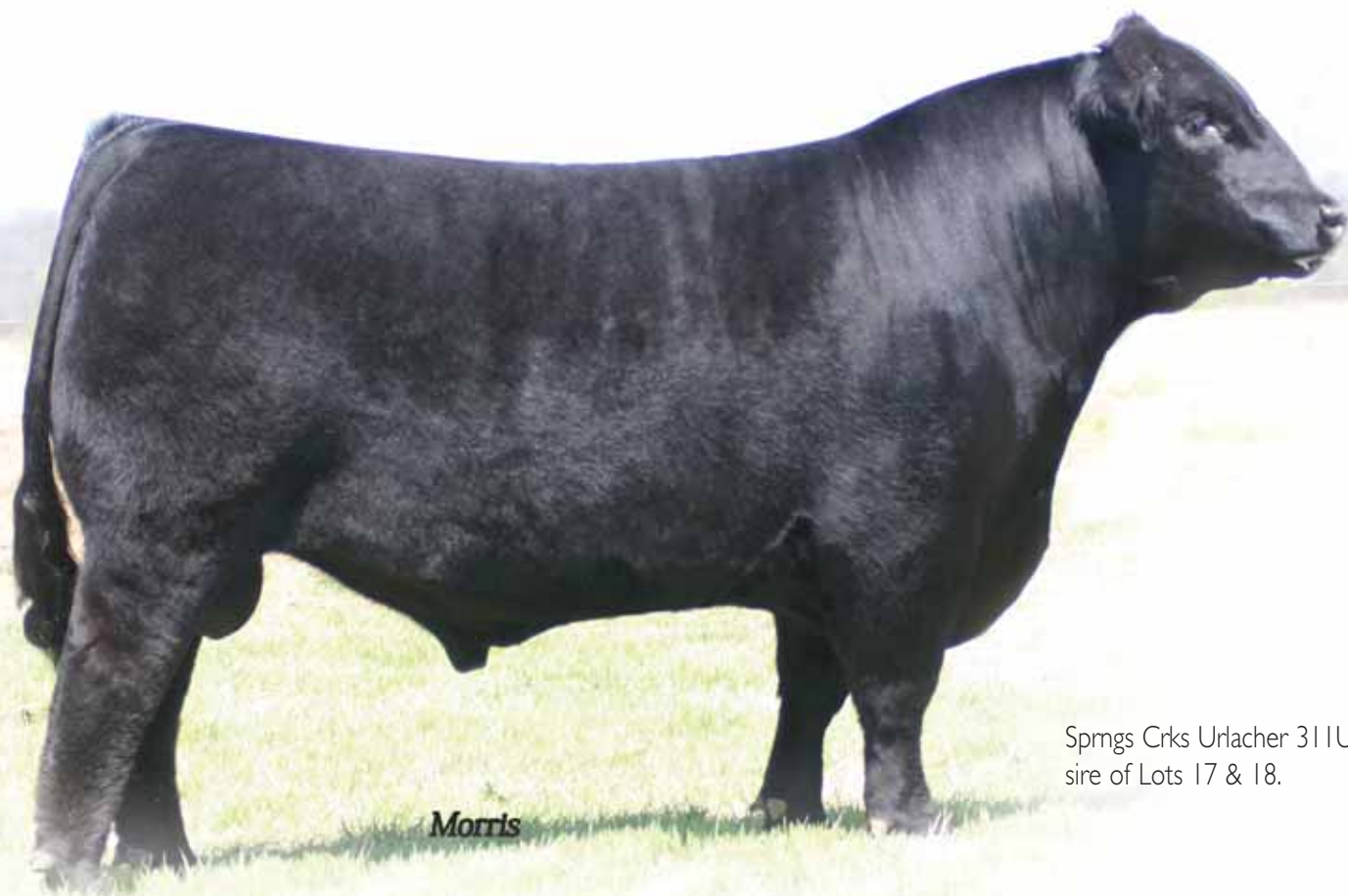
Sprngs Crks Urlacher 311U, sire of Lots 17 & 18.