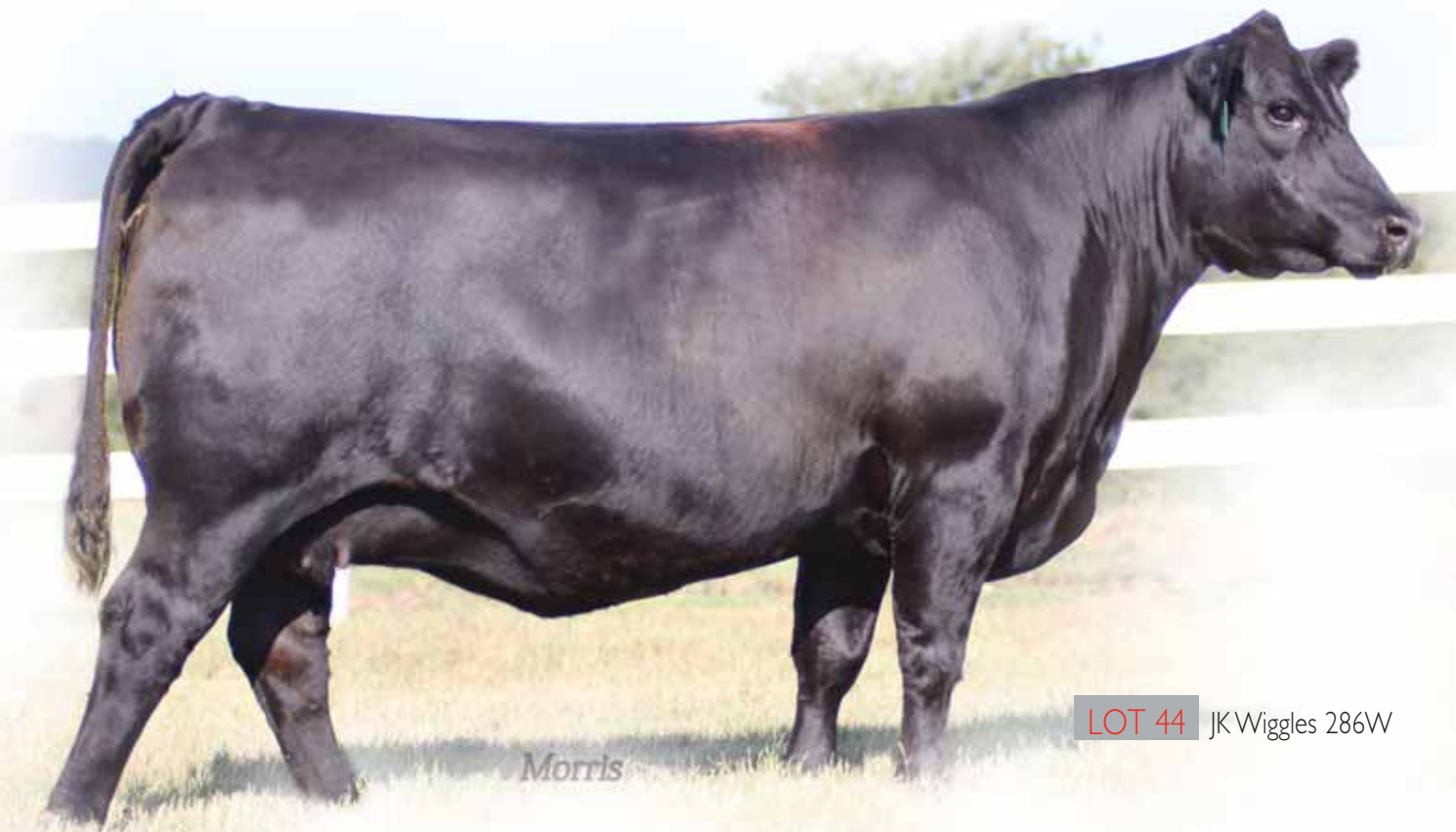
LOT 44 JK Wiggles 286W