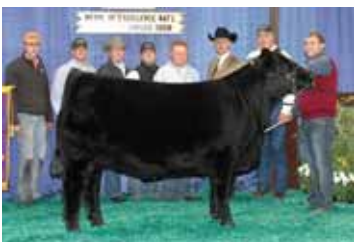
AUTO Peyton 206Y Many-time show champion for Etherton Farms purchased from Pinegar who purchased the planned mating from P Bar S.