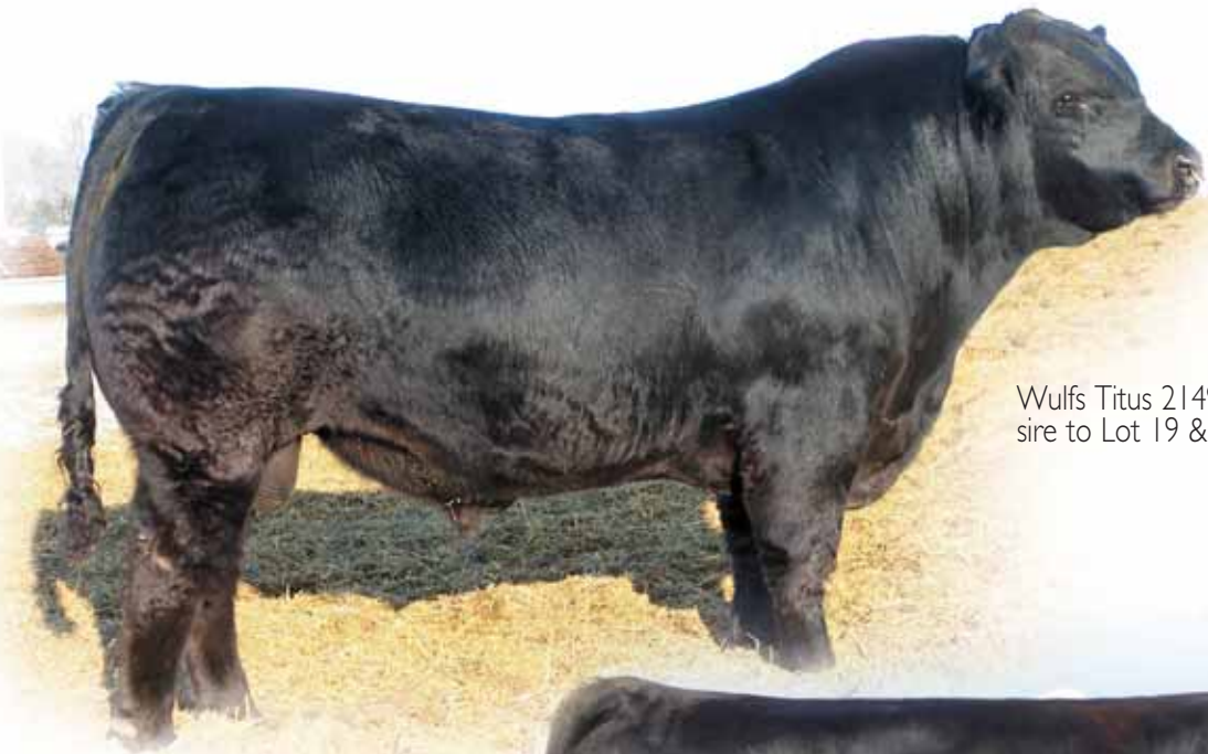
Wulfs Titus 2149T, sire to Lot 19 & 20.