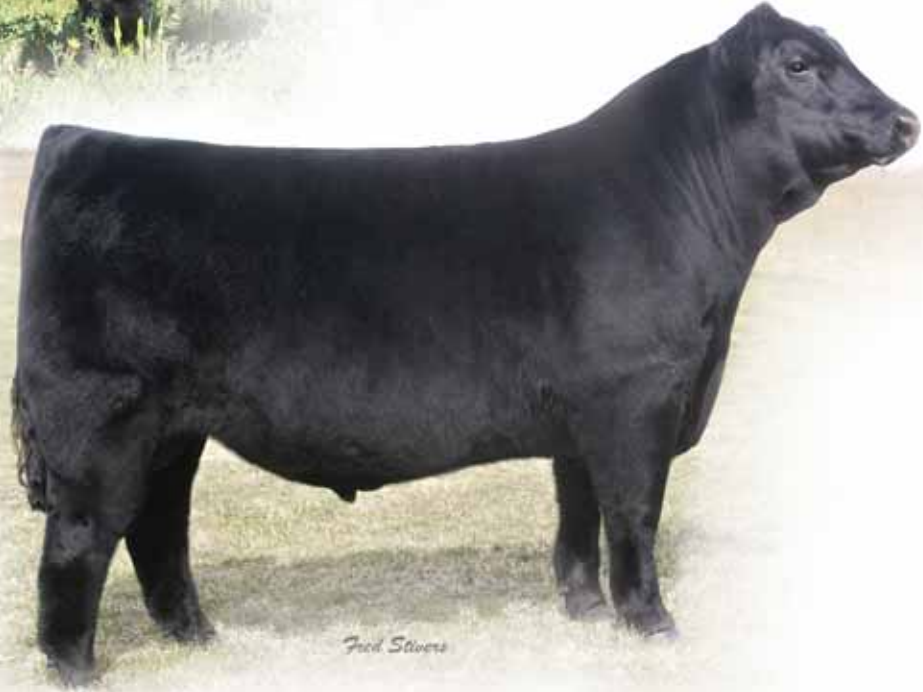
MAGS Y So Tangled, sire of Lot 1C & 1D