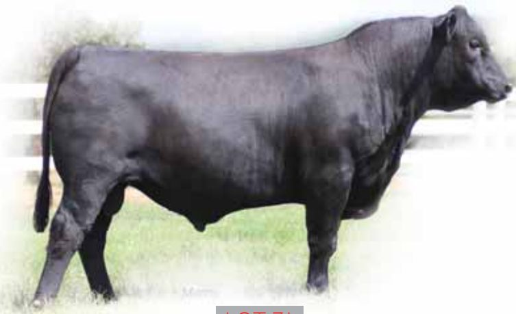
LOT 71 PBR S Zeb 72Z