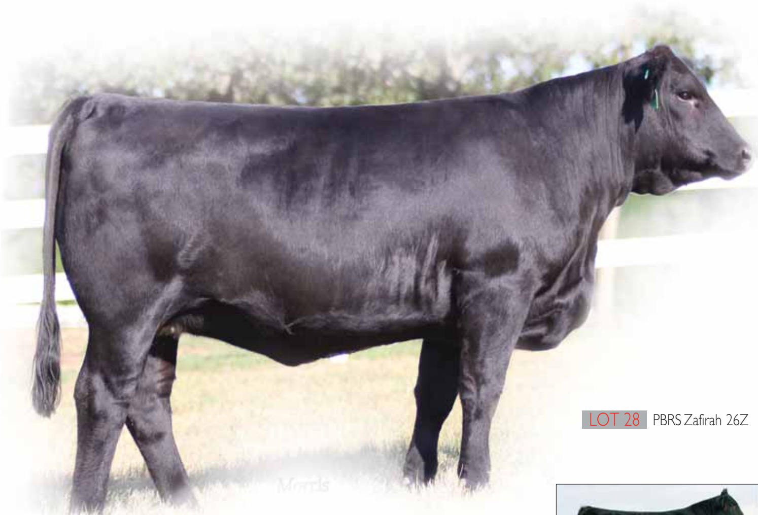
LOT 28 PBRs Zafirah 26Z