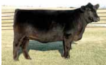
PBRS Pina Marie 811U Proven donor working for Edwards Land & Cattle Co. & Pinegar Limousin.