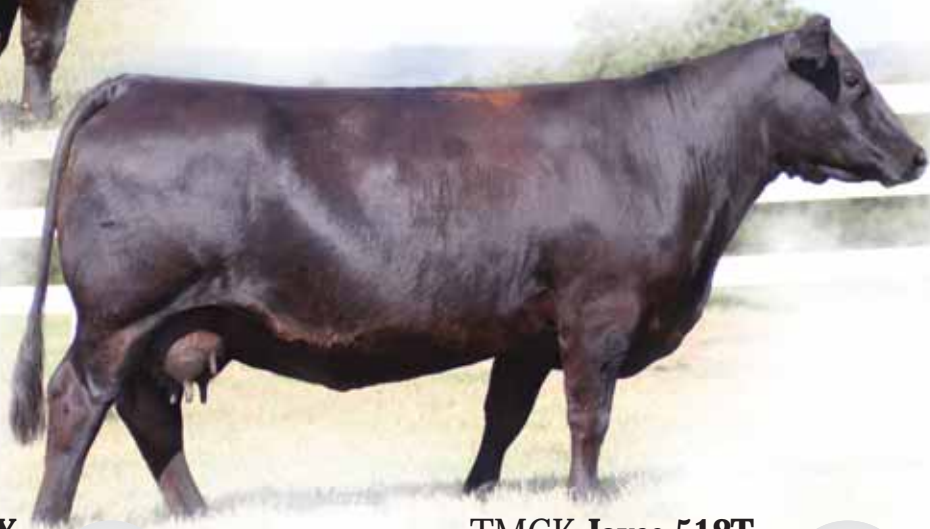
LOT 39 TMCK Joyce 518T