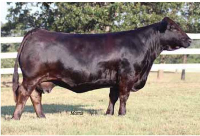
Carrousels Pina Colada, dam of Lot 78.