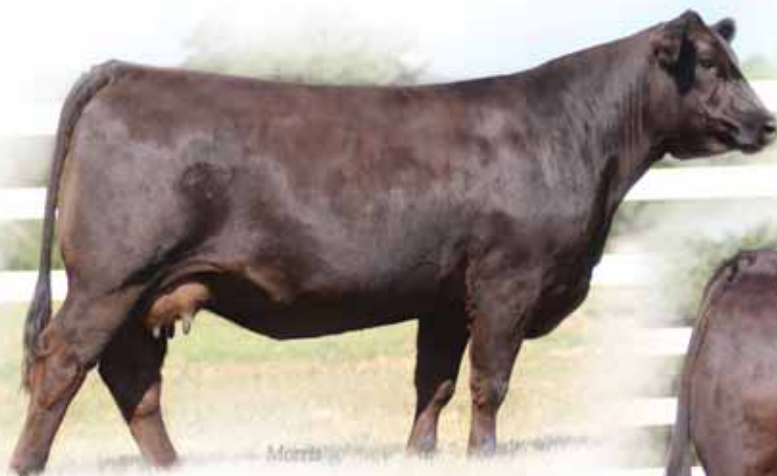
LOT 2 PBRs 0145X