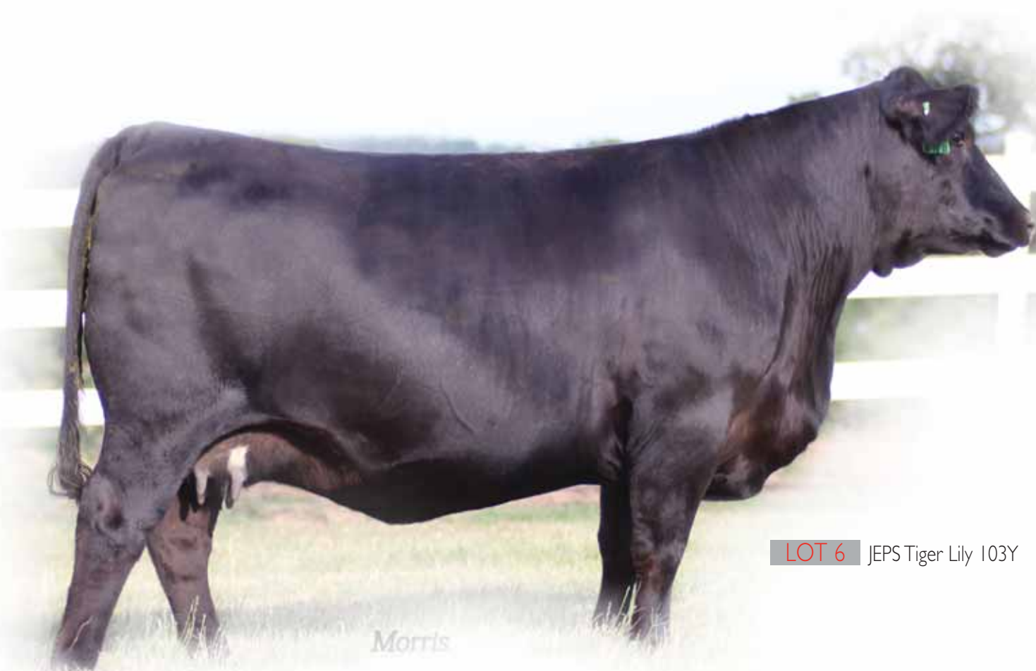
LOT 6 JEPS Tiger Lily 103Y