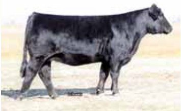
SEEE Unforgettable 079U Top-selling lot from the Edwards Limousin sale purchased by Godfrey Cattle Co.