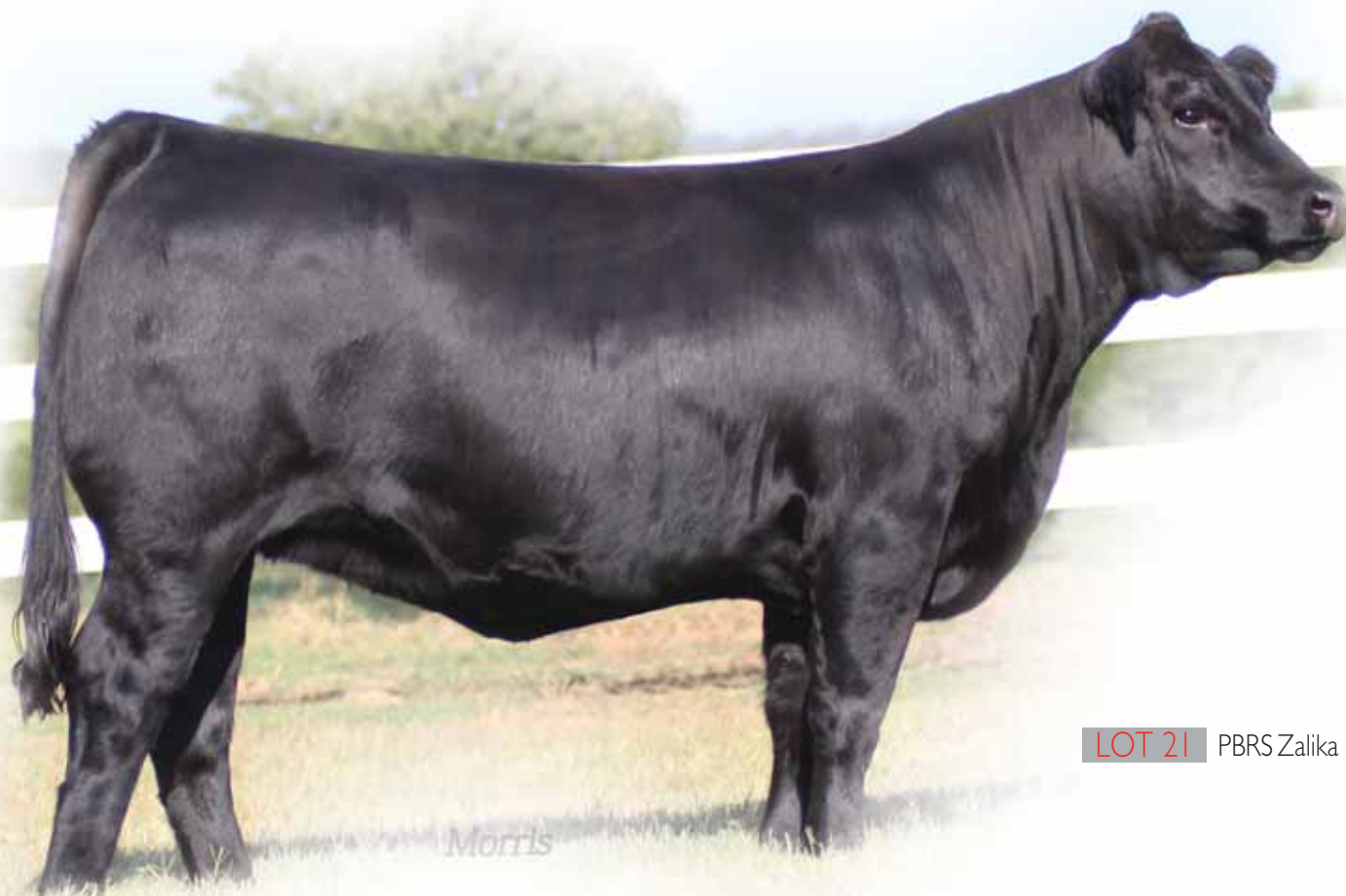
LOT 21 PBRs Zalika 29Z