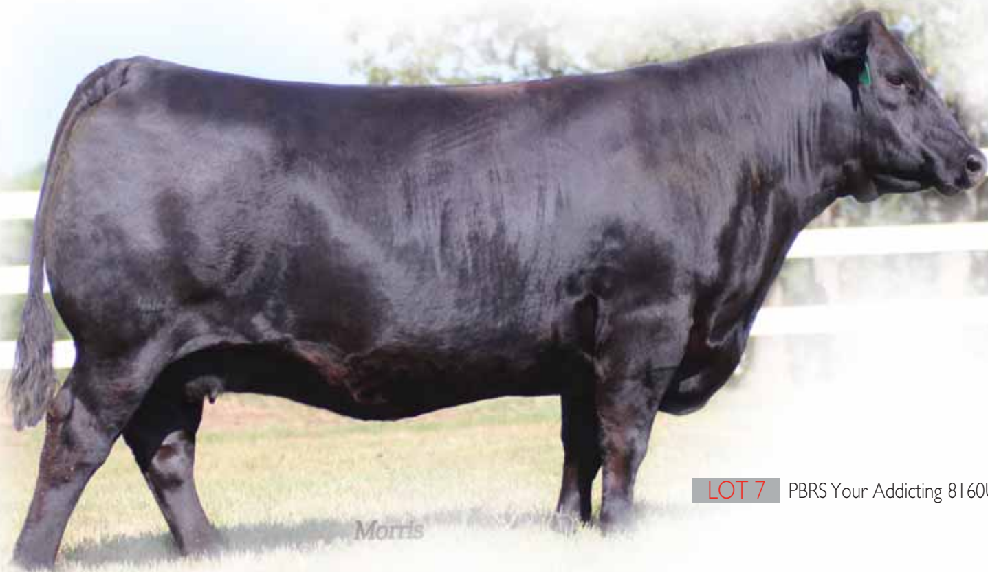
LOT 7 PBRS Your Addicting 8160U