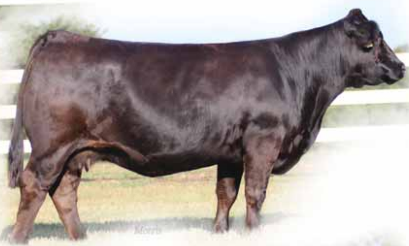
LOT 3 PBRs Unforgettable 8150U