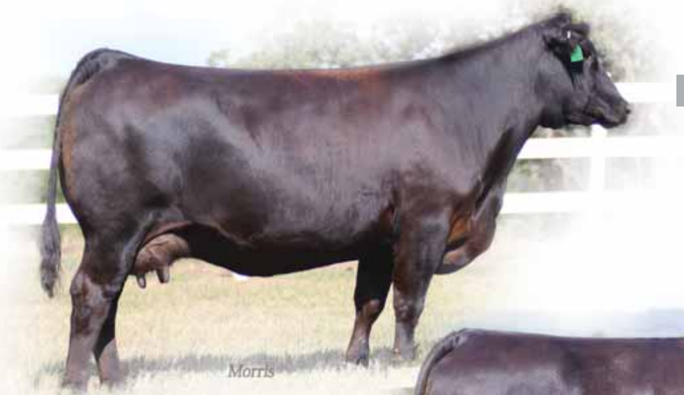
LOT 38 PBRS Xtra Care 070X