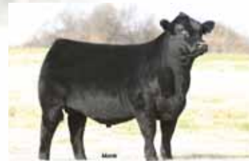
CALO Brickyard 902W, sire of Lot 61 - 63.