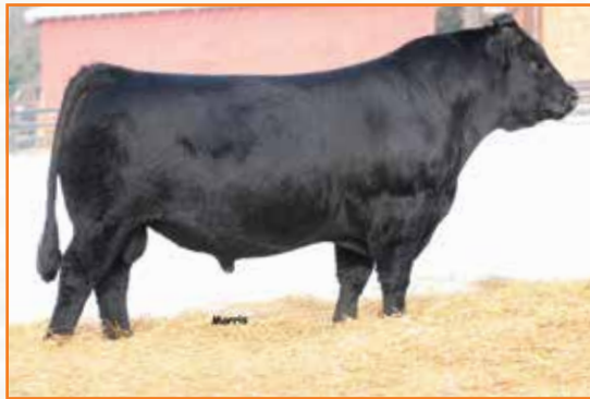
SBLX FIRST CLASS | Sire of Lots 29-36