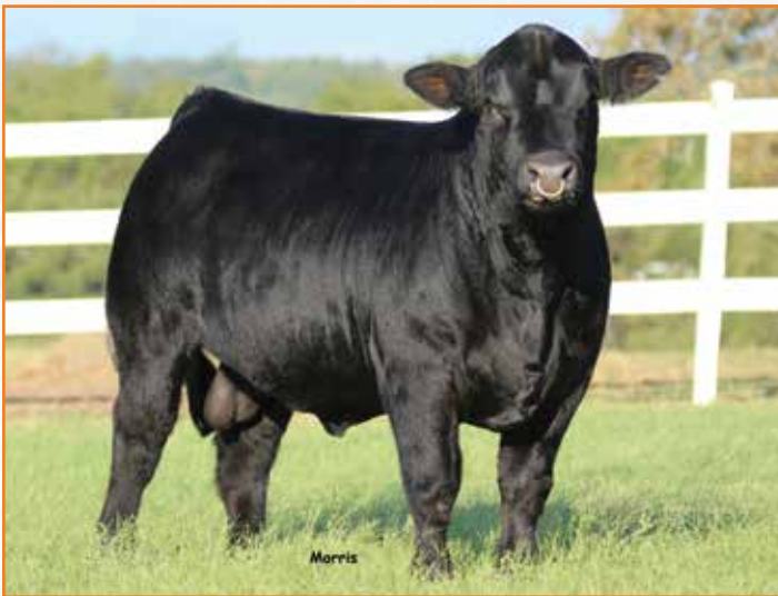
RLBH DAYS OF THUNDER | Service sire of Lot 7

Without a doubt, one of the best crosses ever created at P Bar S Ranch has been the mating of DHVO Deuce back to purebred Angus. This heifer is a daughter of the national champion DHVO Deuce who is responsible for the creation of more champions than most any other sire in the business. She is from the leading P Bar S Ranch purebred Angus donor, LBAF Shawnee 602. She has been a main stay donor and is a daughter of Twin Valley Precision E161. She also happens to be the dam of PBRs Bunk House, one of the leading sires for P Bar S, Stowers and Lonely Valley.