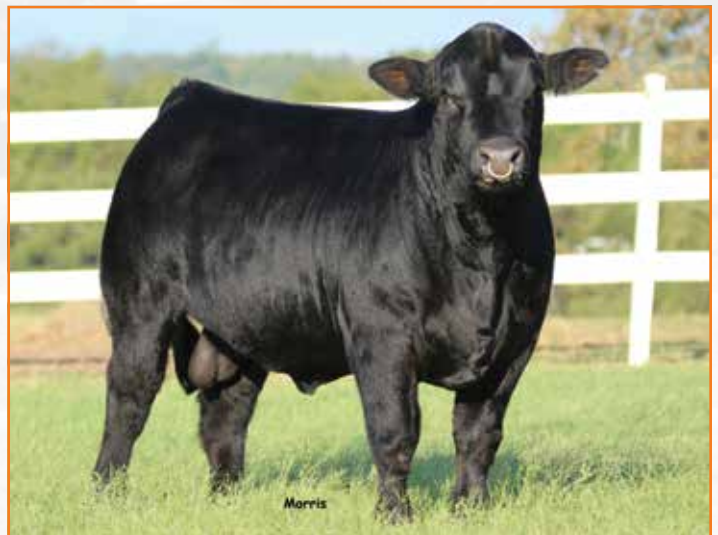
RLBH DAYS OF THUNDER | Service sire of Lots 13-17

When Lim-Flex was created this is exactly what our board members had in mind! This female is absolutely perfect in her design and is one of the finest to ever carry the PBRS prefix. She just happens to be sired by the now deceased but very popular PBRS Bunk House 48B. He is the double homozygous son of MAGS Yip from the purebred Angus donor. LBAF Shawnee 602. She is sired by the elite Angus sire, Twin Valley Precision E161. PBRS 6259 is from PBRS Zandra 294Z, a daughter of the once All-American Futurity supreme champion sire MAGS Xyloid. She sells bred to the black and homozygous polled bull RLBH Days of Thunder, a full brother to RLBH Air Force One.