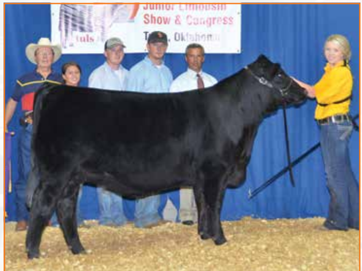
RLBH BE MY VALENTINE | Dam of Lot 20