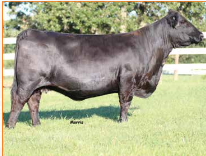
EF UP TO THE CHALLENGE | Dam of Lot 32

AI'd 5.15.18 to RLBH Days Of Thunder (62% Lim-Flex, B/HP) - Safe