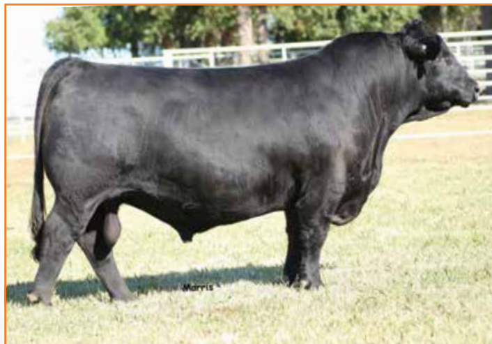
PBR BUNK HOUSE 48B | Sire of Lot 77

PBR7109E is a 50% Lim-Flex son of PBR Bunk House 48B. He is the leading sire for P Bar S Ranch, Lonely Valley/LV Bar and Stowers Limousin. He is deceased but recognized as one of the top sires in the business. This son of his is from a daughter of EXAR Classen from MAGS Manuela.