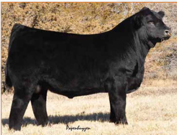
COTTAGE LAKE BORDER AGENT | Sire of Lot 39

This 50% Lim-Flex double black and homozygous polled female is one of the top replacement heifers in the sale. She is sired by the now deceased and once highly syndicated sire, Cottage Lake Border Agent. Her dam is a purebred Angus female and a daughter of SAV Cast Iron. This female will have a guaranteed double black and homozygous polled calf by RLBH Days Of Thunder.