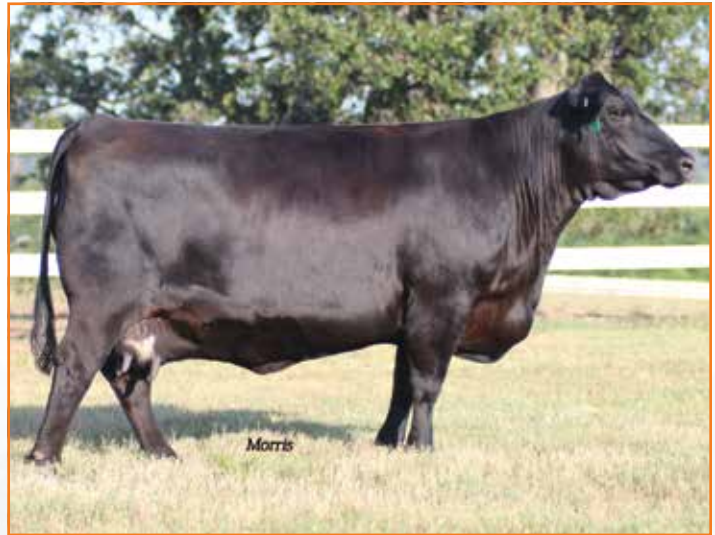
FLLR TIGER LILY | Dam of Lot 19

This 42% Lim-Flex homozygous polled and homozygous black daughter of MAGS Aviator is one top replacement female. She has surfaced as one of the leading replacement females and they felt it necessary to showcase her in the 11th annual sale. She is from one of the P Bar S Ranch foundation donors, FLLR Tiger Lilly, a daughter of Mytty In Focus. She is a leading donor that has as much rib shape and capacity as any 50% Limousin you can find. This female ranks in the top 1% of the breed for gestation, top 2% for marbling, top 4% for $MTI, top 10% for calving-ease direct and CEM.