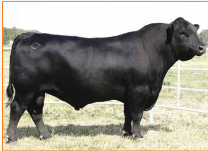
MYTTY IN FOCUS | Sire of Lot 61

Purebred genetics and straight from the heart of the P Bar S Ranch replacement heifers is PBRs Easy Red 0775E. She is a daughter of LFCL Bank Account 701B and from a daughter of MAGS Xtra Wet. This female is deep bodied, easy in her condition and very well made.