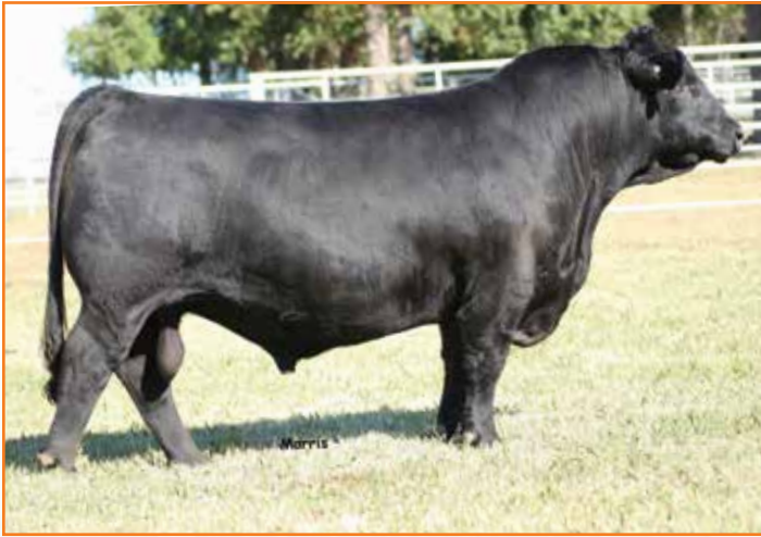
PBRs BUNK HOUSE 48B | Maternal sib to Lot 6