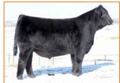
MAGS AVIATOR | Sire of Lots 18A & 18B