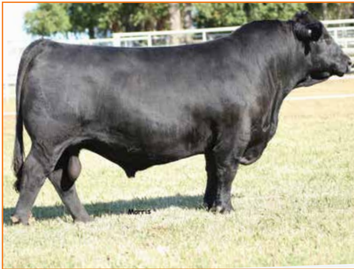
PBRS BUNK HOUSE 48B | Service sire of Lot 37