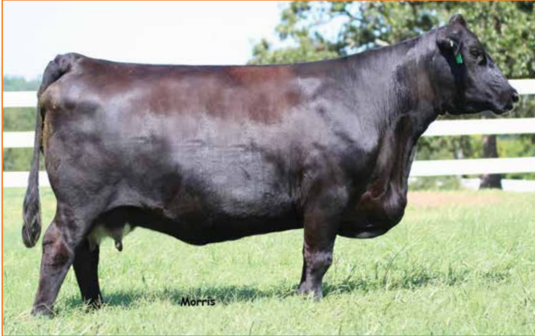
PBRs WINNING WAYS 29W | Dam of Lots 29-31