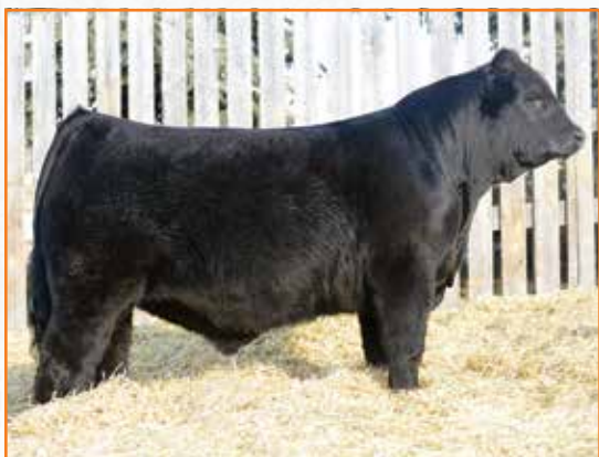
RIVERSTONE CROWN ROYAL | Sire of Lots 25-28

Riverstone Crown Royal is the leading purebred sire for P Bar S Ranch, Riverstone Cattle Co. and Stowers Limousin. He is a son of TMCK Durham Wheat from the Riverstone purebred donor, HSF Your Fantasy. He is a full brother to the all time great purebred show female, Riverstone Charmed. She is the $100,000-valued female that is owned by the Ratliff Family and embryo partnership with Stowers Limousin. The genetics behind this sire is like no other and has tremendous promotion behind it. These Riverstone Crown Royal heifers are from purebred Angus females. The combination of purebred Limousin blended with the best of purebred Angus has worked out well with these heifers.