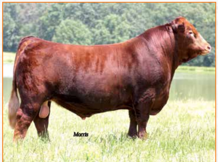
MAGSWL USUAL SUSPECT 538U | Sire of Lot 1

PBRs First Suspect is the result of blending the best Red Angus with the best purebred Limousin. This open heifer is a prime example of exactly why P Bar S Ranch incorporated Red Angus into the mix. They are raising some of the finest purebred Red Angus along with their purebred Limousin, Lim-Flex and Angus cattle. This heifer is sired by the Wies Limousin/Magness Land & Cattle Co. sire MAGSWL Usual Suspect. The Triple Crown winning bull continues to be the go to sire when looking for red, purebred Limousin genetics. He was mated to the purebred Red Angus female, CRSL Champagne, a daughter of Red Northline Jesse James. PBRs First Suspect is awesome from the ground up. She is massive in her foot size, heavy in her bone structure and deep bodied. She is massive in her rib shape and has so much capacity. We certainly love her through her head and neck.