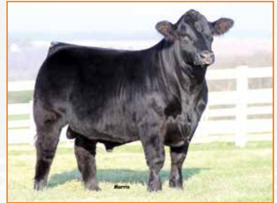
ELCX TURNING POINT | Sire of Lots 21-34