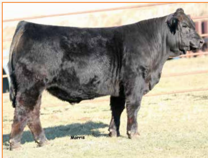
LVLS CARTEL 1023C | Sire of Lot 44

PE'd 4.23.18 to 7.18.18 to RLBH Days Of Thunder (62% Lim-Flex, B/HP) Here is a red, homozygous polled 50% Lim-Flex heifer. She is a result of the blending of the best of purebred Limousin blended with the best of the Red Angus breed. PBR 6333D is a daughter of Wulf's Urban Cowboy 2149U and from a purebred Red Angus daughter of LSF JBob Expectation 6034S.