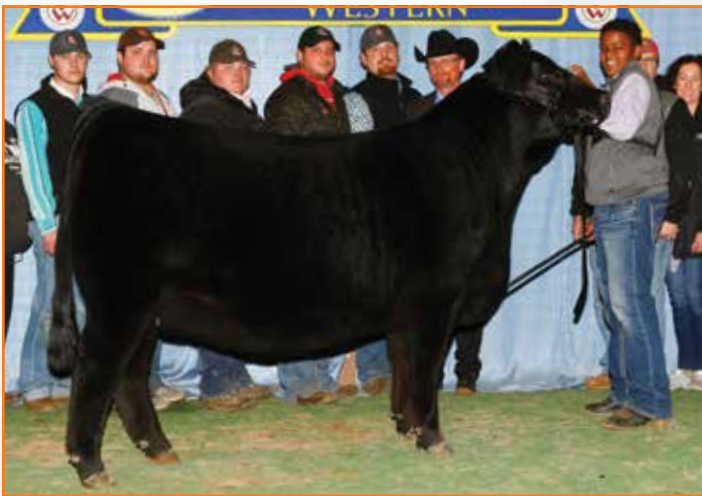
AUTO DANA 265D | Daughter of Lot 10 2017 National Western Junior Limousin Show Grand Champion Lim-Flex Female