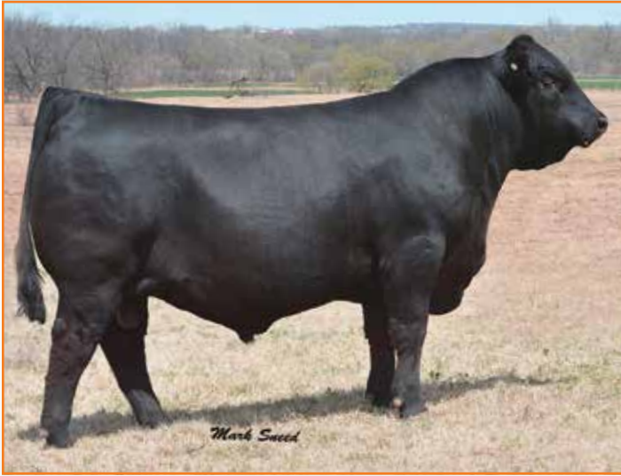
OKSU THE PROFIT 3401 | Sire of Lot 45