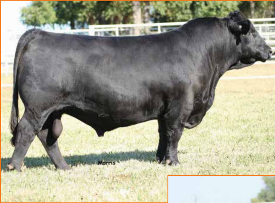
PBRS BUNK HOUSE 48B | Sire of Lot 9