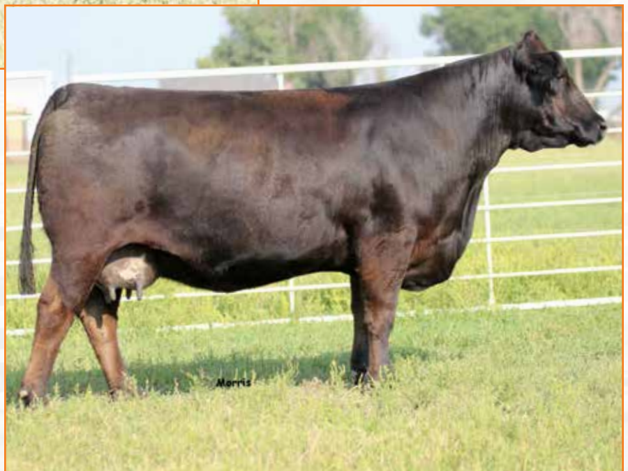
MAGS ZENOVIA | Dam of Lot 9