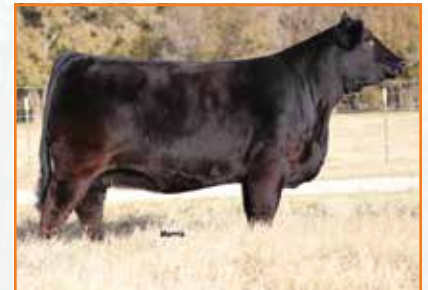
SBLX ZNOTE | Dam of Lots 18A & 18B