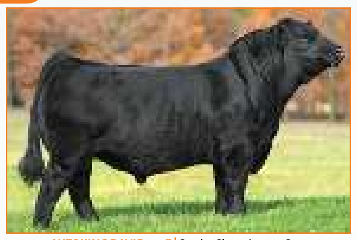
AUTOKING DAVID 120E Service Sire to Lots 44 & 45