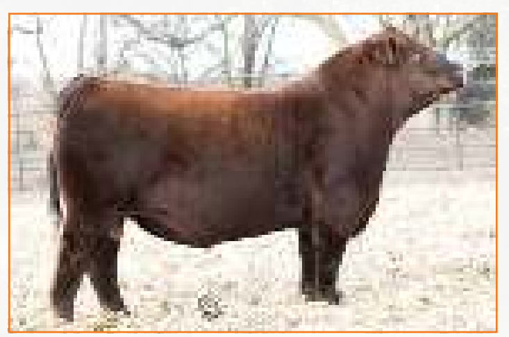
RED WILDMAN CIMARRON 605D Sire of Lot 24

Offering choice between two flushmates. Here is a super exciting opportunity! Red Wildman Cimarron 605D is one of the finest Red Angus bulls to come to the States. He is functional, super thick and incredibly soft and flexible in his pasterns. The dam, CRSL Princess, is a Firestorm daughter that is a tremendous producer. LOT 24A: PBRS 9230, 66-lb. bull calf, born 9.15.19. Sells with commercial recipient LOT 24B: PBRS 9229, 61-lb. heifer calf, born 9.14.19. Sells with commercial recipient