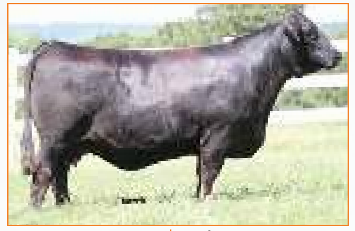
EF WINDSONG Dam of Lots 31 & 32