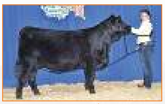
SLKF SISTER ACT 1322 Dam of Lot 8

LIM-FLEX(50/45.1) DUE: 9/22/2019 DBL POLLED HOMO BLACK PBRS 9272G APPLIED CED BW WW YW MK CEM SC DC YG CW RE MB śΜI 21 -.28 1.8 64 92 .53 FAMOUS 7001 GAMBLES HOT ROD CHAMPION HILL LADY 703 SILVEIRAS STYLE 9303