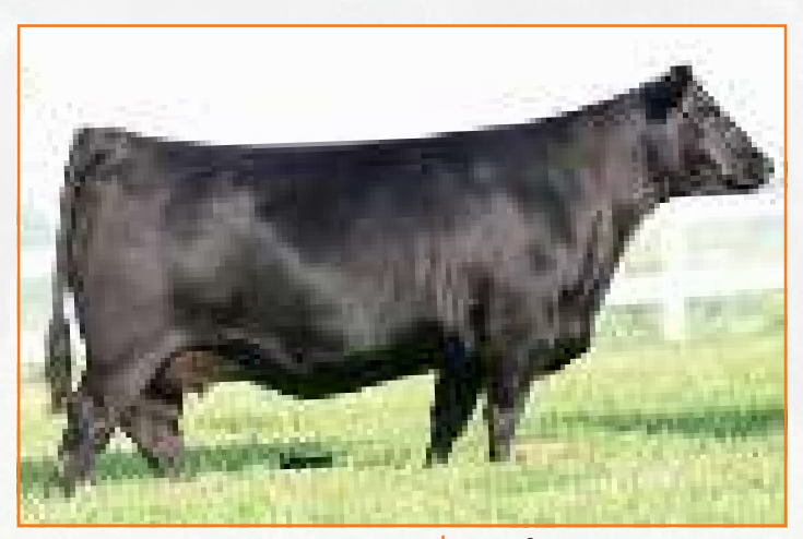
BUF EPPIONIA 7307 Dam of Lot 12

MAGS Zenovia 3942A is a big-league female sired by the once All-American Futurity supreme champion bull, MAGS Xyloid. Her dam is a daughter of AUTO Dollar General who sires cattle the way breeders demand them out of an Angus dam. Zenovia is an eye-appealing female who is level from her hooks to pins, has a nice udder in lactation and clean fronted. She offers a sound set of numbers as well. The only choice you have to make is to which sire you'll breed her too.