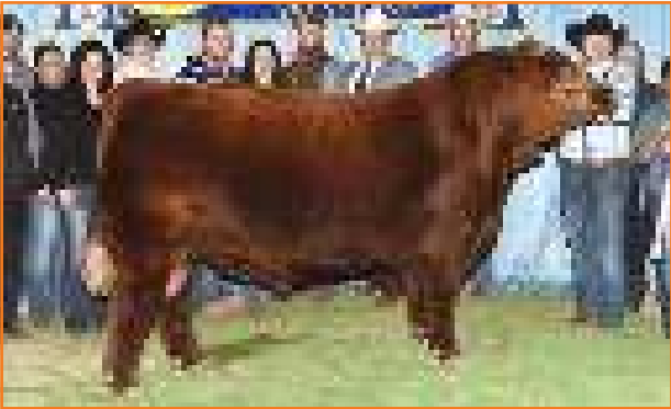
SIX MILE TAURUS 519A | Sire of Lots 16 & 17

We have a set of full sisters in Lot 16 and 17. Sired by the extremely popular Six Mile Taurus, a two-time National Western Stock Show champion who is siring cattle that work in the show ring as well as in the pasture. To say his progeny have been popular would be an understatement. They have been in high demand across the country. Their dam is from the Carrousel Red Angus program, known to be a solid producer. PBRS Reagan and PRBS Kaydee both rank in the top 2% for Milk. Both are carrying a calf by our Red Angus herd sire, J6 Nexus 131F. Don't struggle over which one to buy, take both home, you'll be glad you did.