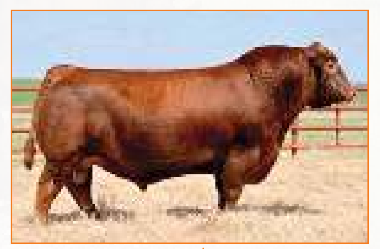
RED BLAIRS BINGO 581B Sire of Lots 13, 14 & 15

Starting off the Red Angus bred heifer section is this daughter of Red Blairs Bingo 581B one of the most celebrated breeding sires in North America. His progeny have been in high demand due to their consistency and phenotype. PBRS Blair represents him well. Her dam, 5L VISTA 2806-3088, comes from 5L of Montana. PBRS Blair is clean in her lines and moves out freely. The calf she is carrying is from our own Red Angus herd sire PBRS Nexus 794, a son of Silveiras Mission Nexus out of a productive J6 Farms cow. PBRS Blair ranks in the top 17% for CEM, 20% for CED and top 25% for Milk. She is a paternal sister to Lots 14 and 15.