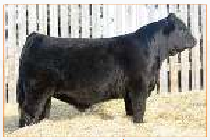
RIVERSTONE CROWN ROYAL | Sire of Lots 25-29

Riverstone Crown Royal semen packages available for $750 each for 10 units. Contact any member of the sales team.