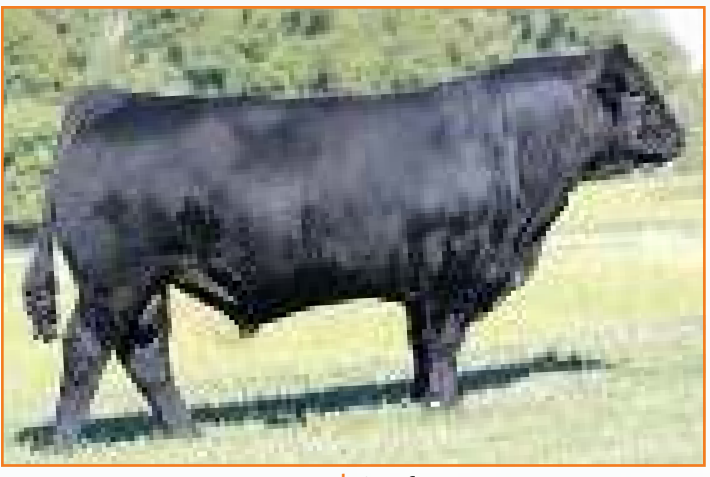
AUTO CRUZE 132X | Sire of Lots 30, 31 & 32

Here is a trio of AUTO Cruze 132X daughters—Lots 30, 31 and 32. Cruze is a bull raised in the Pinegar herd that has been a tremendous producer of champions and productive cattle. The dam of Lot 30, PBRS Dutches 790X, is one of those can't-miss donors. Check out the growth and milk this one offers. The Dam of Lots 31 and 32, EF Windsong, was a many-time champion for Rachel Booth and has proven to be a prominent purebred donor at P Bar S. We think you'll really like the females when you see them sale day. The guesswork is done, it's all bred into them.