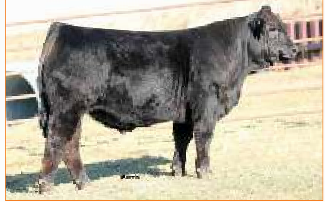
LVLS CARTEL 1023C | Sire of Lots 60-63

We are wrapping up the sale with these four sons of LVLS Cartel 1023C, our standout herd sire by EF Zen out of an outstanding LVLS Top Criteria daughter. The Cartel cattle born at the ranch display tremendous amounts of growth and performance as they mature, giving us confidence each of these sons will go on to become outstanding herd sires in their own right. Take note, each of the dams listed on this page have the good fortune of having DHVO Deuce in their pedigrees, giving us even more confidence in the producing ability of these outstanding herd-sire prospects.