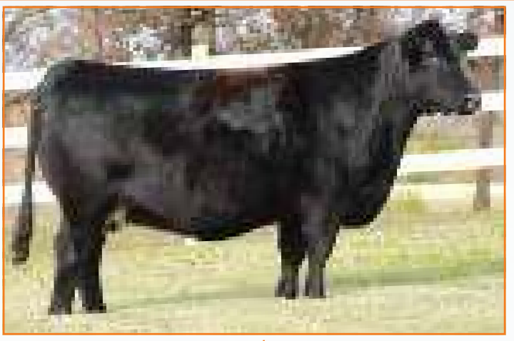
EF ZYNGA 356Z Dam of Lot 10