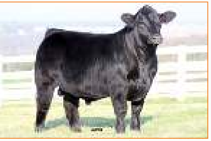
ELCX TURNING POINT 641Z Sire of Lot 7

What an exciting opportunity here! A guaranteed heifer pregnancy from one of the hottest Angus bulls siring show cattle, Colburn Primo 5153, out of SLKF Sister Act. Many will remember Sister Act from the 2014 Tulsa State Fair where she was named Third Best Supreme Heifer over all breeds. This purebred donor has extraordinary power in her makeup and lineage. Crossed with Colburn Primo should create an out-of-the-world, first-class heifer.