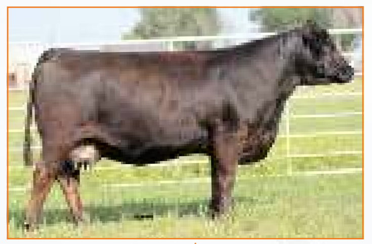
MAGS ZENOVIA | Dam of Lot 11

You get to mate her the way you want! Yes, you read that right. It doesn't get much better than that. EF Zynga 356Z is a daughter of TC Total 410 from MAGS Pretty Christine (she goes back to the original EXLR Daktoa sire). When you study her picture, you see a soggy, broody female that will make functional cattle. You won't go wrong with this investment, no matter the sire.