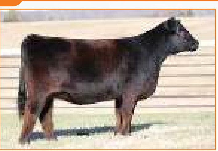
AUTO DIRECT DRIVE 107D Sire of Lots 36-39