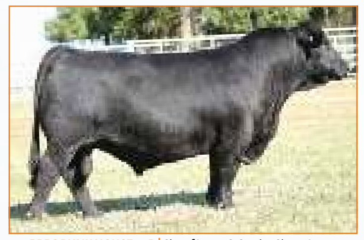
PBRS BUNK HOUSE 48B Sire of Lot 45 & Service Sire to Lot 47

Study the pedigree and the numbers and we think you'll agree, she has it all. Being out of MAGS Eagle, a growth and carcass trait leader, and out of a MAGS Y So Tangled daughter gives you the confidence to bid until you own her. She ranks in the top 25% for eight economical traits.