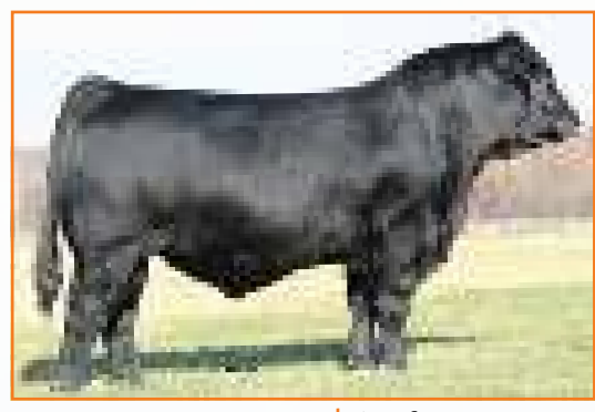
AUTO DIRECT DRIVE 107D | Sire of Lots 55, 56 & 57

We are starting the Limousin bull section with a trio of AUTO Direct Drive paternal brothers, Lots 55, 56 and 57. As you can see by the pictures, AUTO Direct Drive stamps his progeny with consistency—a lot of rib shape and rear-quarter. They are all freemoving, strong-topped and soggy middled. They have the right pieces and parts and will work in any scenario.