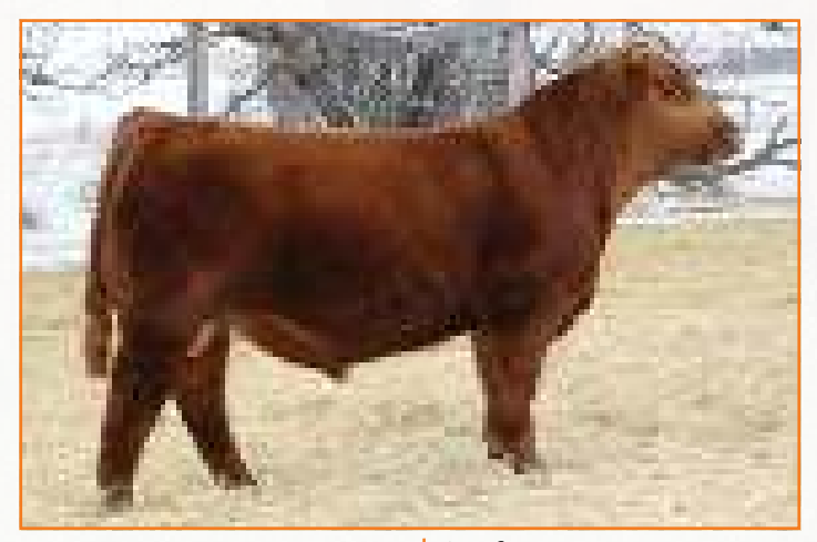
SIX MILE TAURUS 519A | Sire of Lots 49, 50 & 51